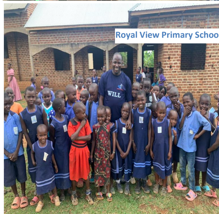
Royal View Primary School