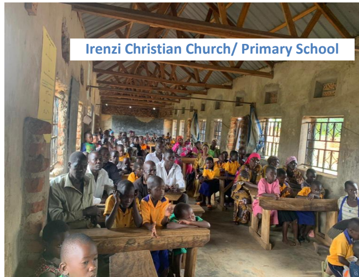
Irenzi Christian Church/ Primary School