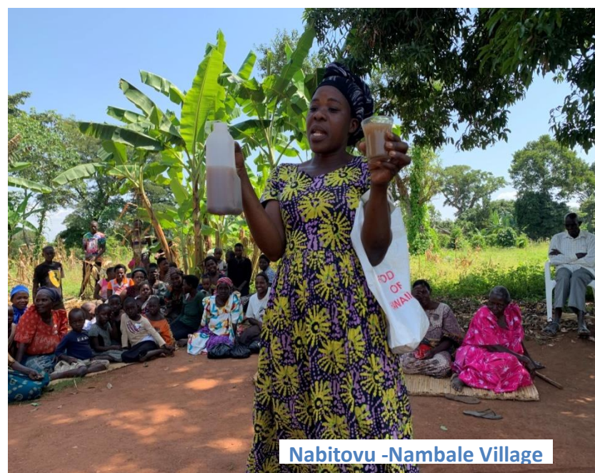
Nabitovu -Nambale Village