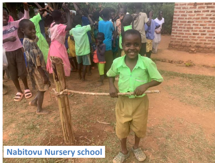
Nabitovu Nursery school

We have over 60 requests from different communities, schools, churches, villages, prisons and hospitals that urgently need clean water. Here are some photos of those communities. Some of these villages have been waiting for over 5 years for clean water to come to them. You can choose a particular community to help.